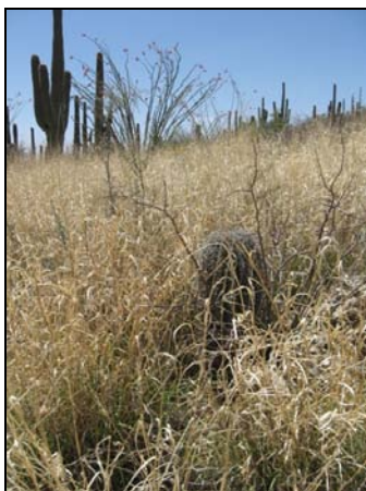
Competes with saguaros and other native vegetation