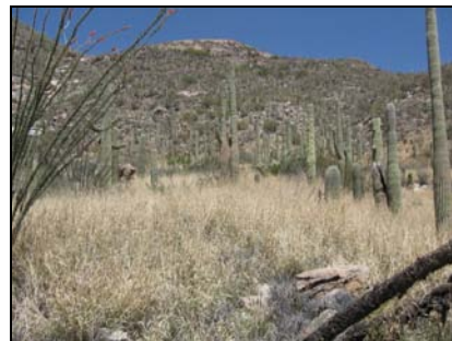
Fuel load is 3x higher than typical desert, leading to large wildfires