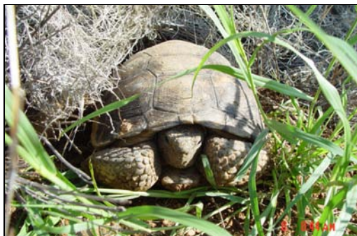
Inhibits animal movement, alters habitat and displaces wildlife forage