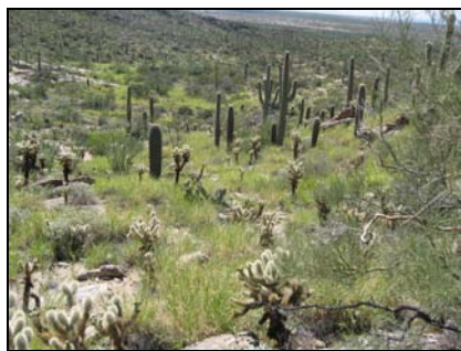
Invades undisturbed desert habitat

Buffelgrass, an introduced invasive grass, forms dense stands, crowding out native plants and animals, and bringing fire to an ecosystem that is not meant to burn. Please visit www.buffelgrass.org for more information.