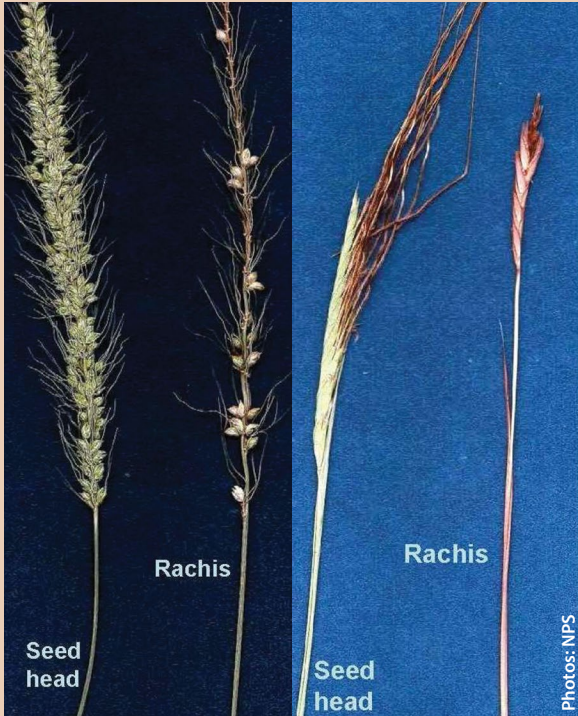
Bristlegrass Setaria species NATIVE

Please take care to carefully identify weed species and not accidentally remove desired native species. Following are three of the most common native grasses confused with non-native buffelgrass.